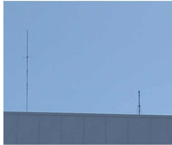
The Magic City Discovery Center with Amateur Radio antennas on the roof